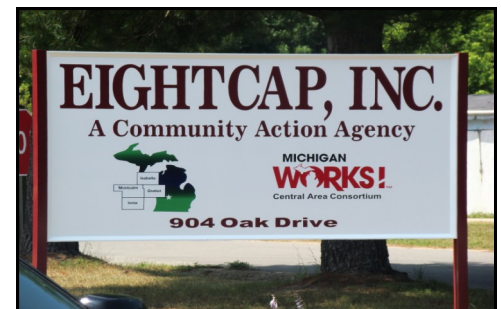
The sign outside of EightCAP, Inc. in Greenville where Summer Youth Employment Program participants are stationed.

This week, the media crew definitely noticed improvements at many of the job sites. We can hardly wait to see what next week has in store.