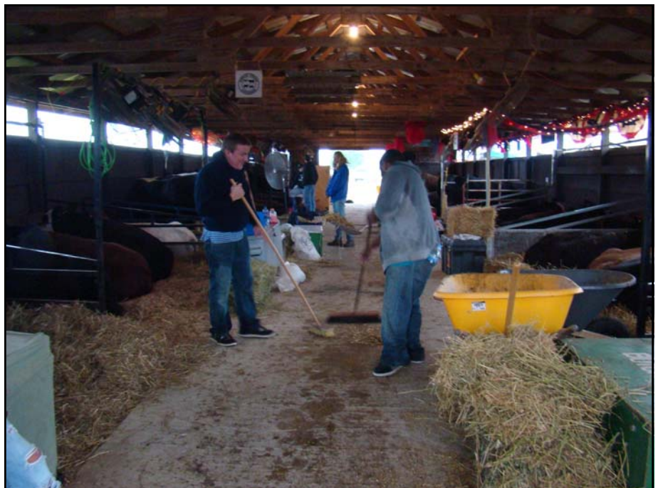
Participants at the Gratiot County Fair for Youth shoveling walkways for fairgoers.