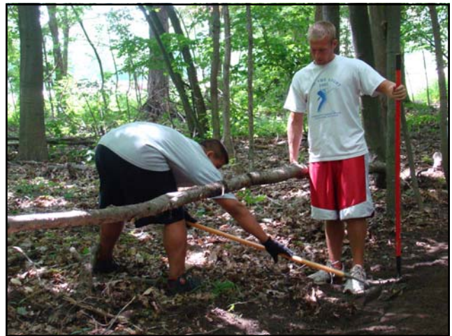
SYEP participants clearing the trails at Reeds Park.

All in all it was an eventful week. Those are a few of the rough and tough jobs in the SYEP. Some jobs are a little dirty, but the reward at the end makes it all worth while.